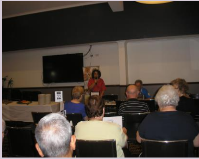
Mayor of Palmerston