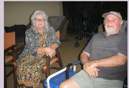
Dot's BBQ 29/8/19