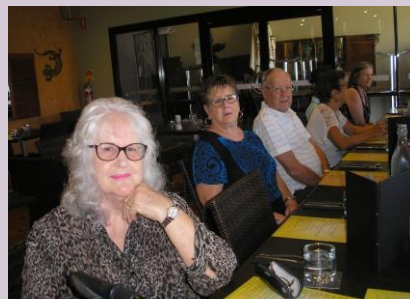
Lunch at Salt & Peppera Restaurant 26/9/19