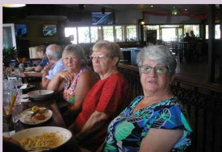
Lunch Good Times Bar & Grill 25/7/19